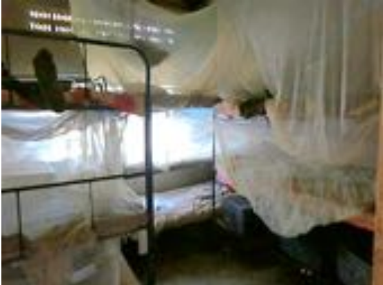
Despite the general availability of mosquito nets, some students choose not to use them because they feel they reduce airflow. We expressed health and safety concerns about overcrowding in the hostels, but the school feels it is under pressure from parents to take