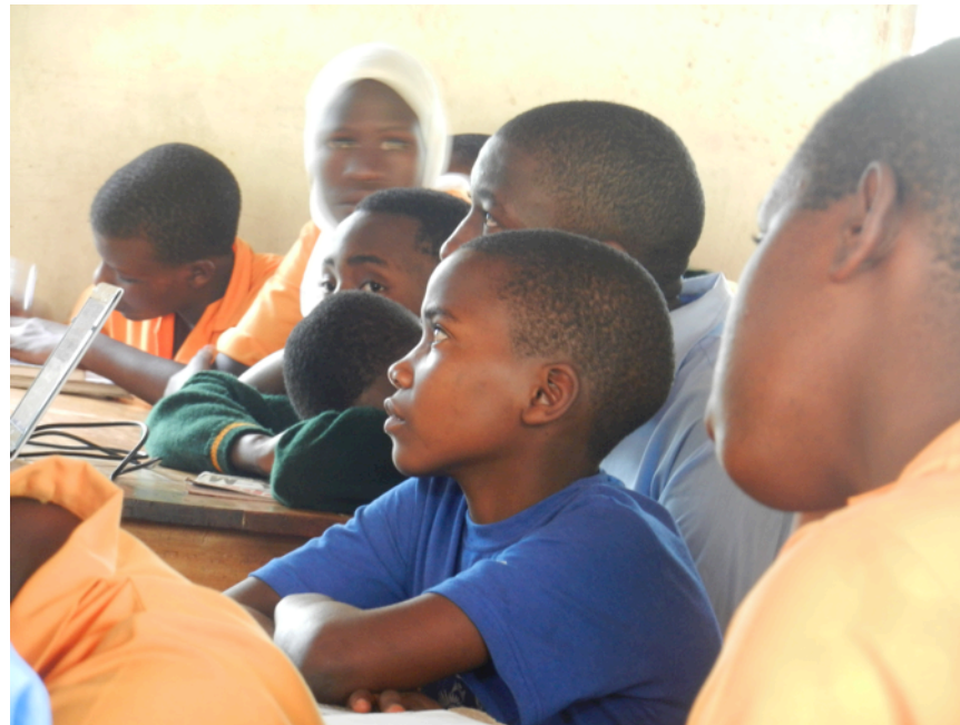
Senior one students at Isaac Newton High School in lesson without pictures