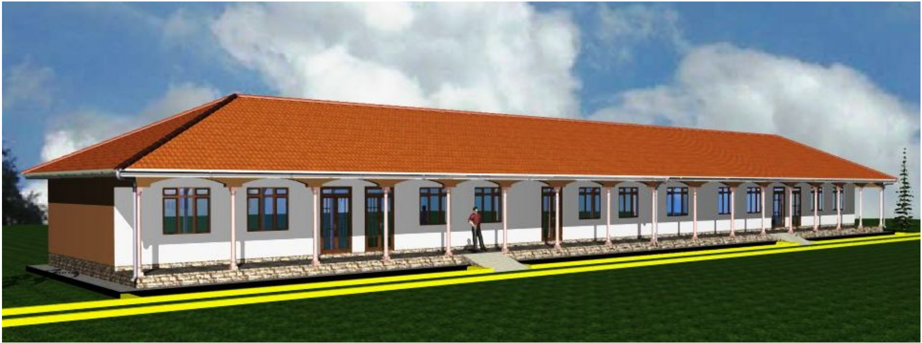
Isaac Newton High School: Drawing of Multimedia Block