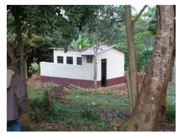
The boys' toilet block has 4 stances for students with a separate toilet for male staff and visitors.

http://www.ecosanres.org/pdf_files/EcologicalToilets-PeterMorgan-Mar2009.pdf