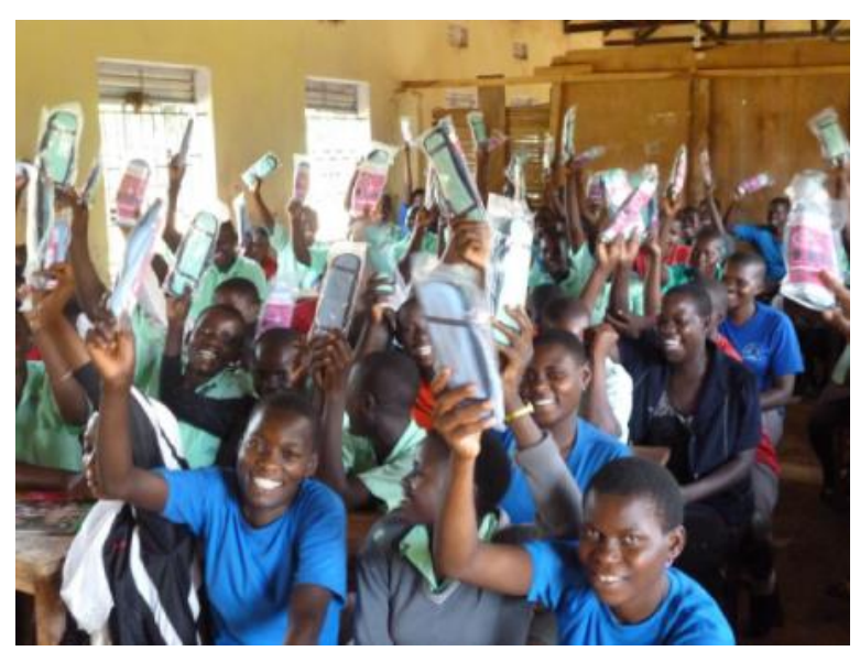
Mustard Seed Girls receiving sanitary pads and training in their use

www.ugandahumanistschoolstrust.org Charity Registration Number 1128762