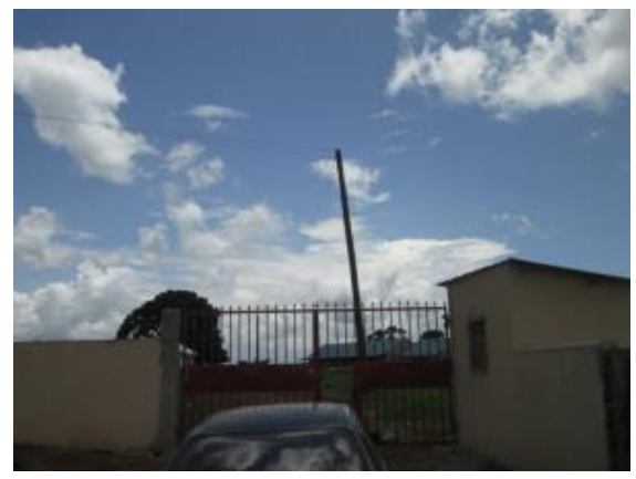
New secure gated entrance to Mbute Campus

been started using grants through IHEU, were completed. A further £4,300 was provided to reconstruct the access road to the school site. Also from UHST funds we were able to connect the school site to mains electricity.