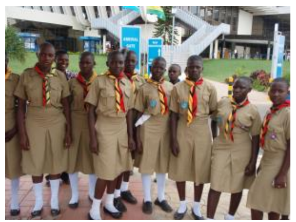
Mustard Seed girl scouts at Kigali airport, Rwanda

While not exactly a learning resource we have worked in 2014 with Central London Humanists and a Ugandan/Dutch NGO called Afripads to provide all girls in the three secondary schools with free packs of washable and re-useable sanitary pads. These are already making a huge different to the girls comfort when they have their menstrual periods, with a consequent decrease in girls' absence from lessons and from school.