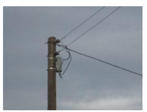
Arrival of mains electricity to Mbute