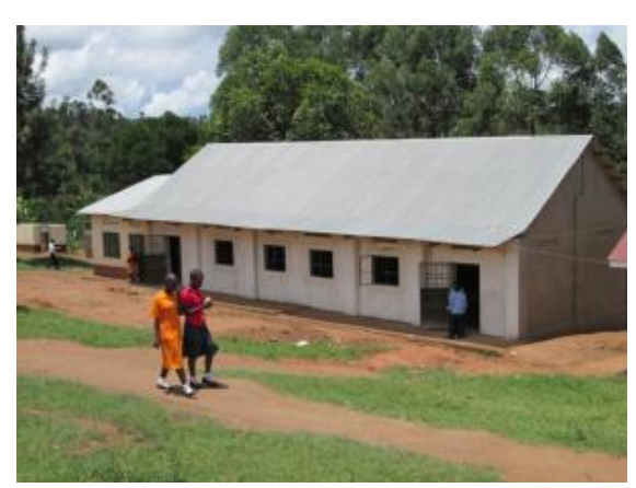
Examination Hall at Isaac Newton School

installing glazed windows and painting inside and out. The glazed windows are essential to prevent exams from being disrupted by wind and rain during thunderstorms.