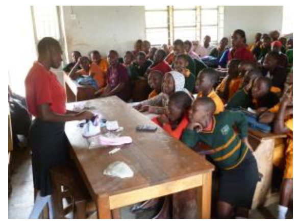
Isaac Newton girls being trained to use Afripads

While not exactly a learning resource we have worked in 2014 with Central London Humanists and a Ugandan/Dutch NGO called Afripads to provide all girls in the three secondary schools with free packs of washable and re-useable sanitary pads. These are already making a huge different to the girls comfort when they have their menstrual periods, with a consequent decrease in girls' absence from lessons and from school.