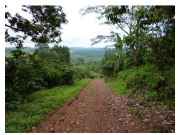
Improvement to access road to Mbute site