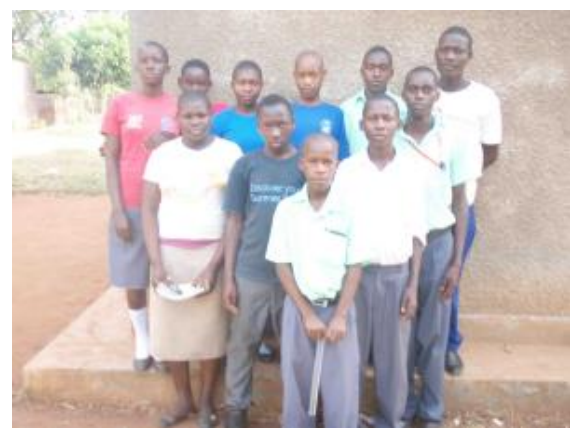
Scholarship students in S1 at Mustard Seed

North-East Humanists provided an additional 17 scholarships to students attending the new Isaac Newton High School campus at Mbute Hill.