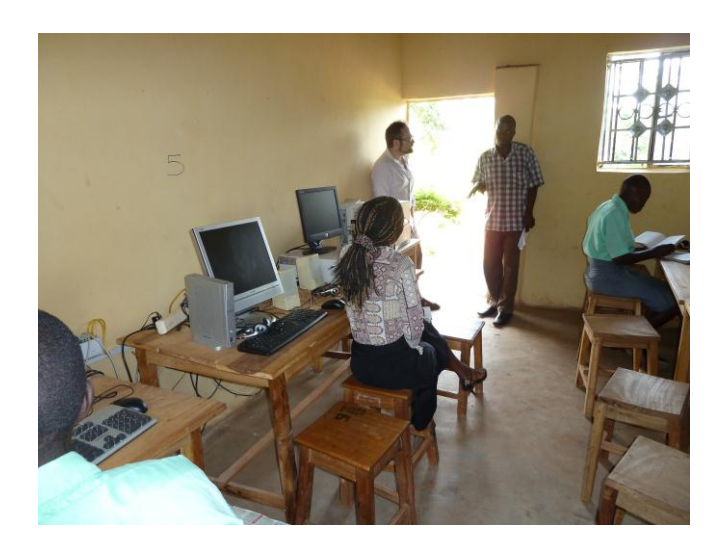
New Computer Lab at Mustard Seed School