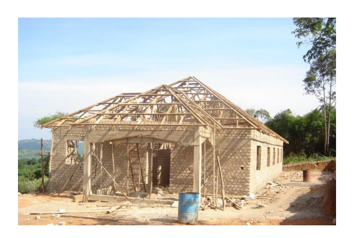
Work on Girls' Dormitory at Isaac Newton School