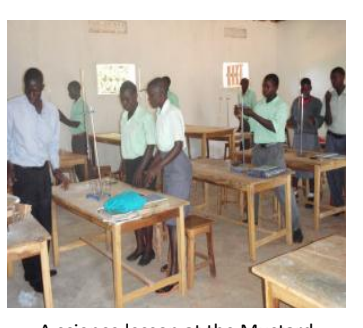
A science lesson at the Mustard Seed School

to books for Senior 3 students, which completes provision of basic textbooks for all four of the O-level