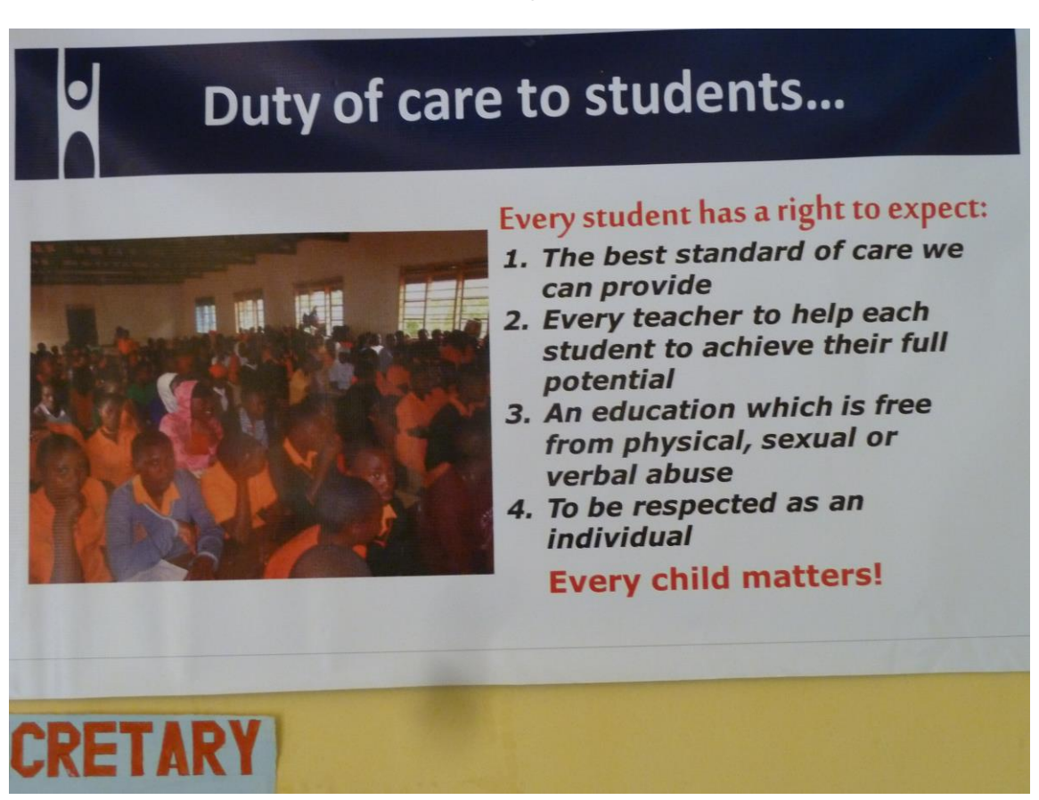
The above wall poster greets visitors to the school in the Secretary's Office